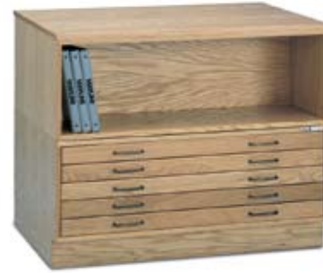
Golden Oak Finish